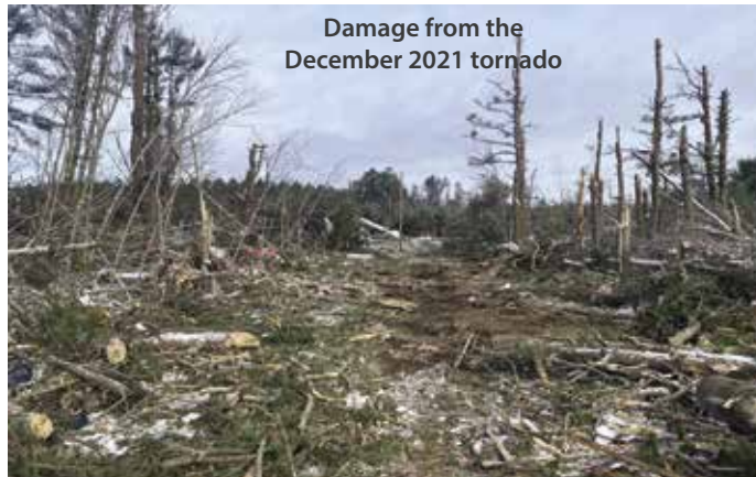
Damage from the December 2021 tornado

Reliability Of course, one of the biggest benefits of a smart vegetation management program is reliability. Strategic tree trimming reduces the frequency of downed lines causing power outages. I'm sure you will recall the December 2021 tornado events that hit our service area. Trees were tossed around like toothpicks and caused extensive outages that took three days to restore and caused in excess of $200,000 in damages. Did you know that trees are the number one reason for electric disruptions?